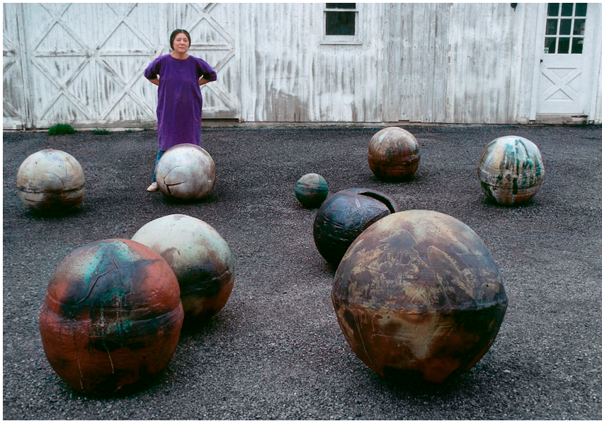
Toshiko Takaezu with moons, 1979.

“On a personal note, I grew up in Hawai‘i hearing about Isamu Noguchi, and I know my great aunt would be so pleased that her work will be presented in the museum he founded and designed. It is particularly symbolic to announce this project on what would have been her 100th birthday. It is so meaningful to be able to do her legacy justice on such a significant milestone.”